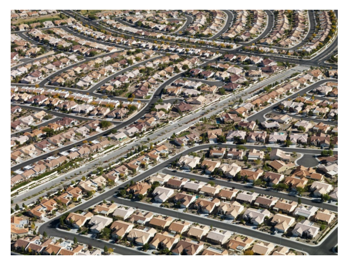
Las Vegas, NV Sprawl

Half-day kindergarten, while still a fixture in some communities, is essentially gone in most urban school districts, replaced not only by full-day kindergarten, but also all-day pre-kindergarten and even the expansion of public pre-school for three-year-olds. This has been possible, in part, because of the presence of unused space in school buildings where the number of school age children has declined. These underutilized school spaces also serve as potential sites for the expansion of school-support joint use, as well as community-related joint use, especially for the location of services such as adult education, job training, or sports leagues that can enhance opportunities and outcomes for underprivileged communities.