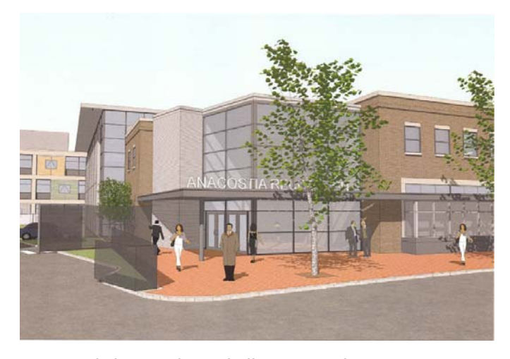
Savoy and Thurgood Marshall Sports and Learning Center

We propose that a fundamental shift is needed in how we view our public school buildings and grounds; a new social contract for the use of our public school infrastructure.