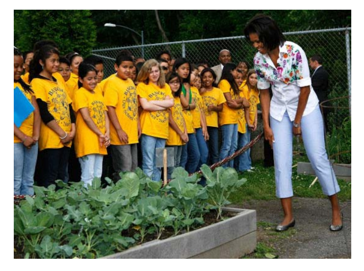
First Lady Obama at Bancroft Elementary School

factors in the physical environment;" opening them can directly increase access to recreation space, especially outdoor green spaces, translating into increased opportunities to participate in physical activities. In searching for ways to increase healthy physical and social habits of both children and adults, public health advocates have identified these public infrastructure assets-public school buildings and grounds-as places that can and should play an important role in increasing physical activity not only among children and adolescents but also contributing to healthier communities.<sup>18</sup> In some communities neighborhood schools may be one of few places where children can be involved in active play.